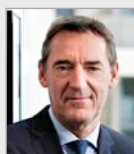
Jim O'Neill Former Chairman of Goldman Sachs Asset Management