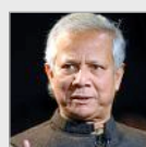
Muhammad Yunus Founder of Grameen Bank and Nobel Peace Prize laureate