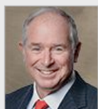
Stephen Schwarzman Chairman & Co-Founder of Blackstone